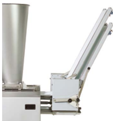
Optional height conveyor belt / double belt outfeed system for transporting dough pieces to max. 165 cm outfeed height.