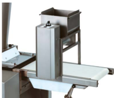
Stainless steel automatic flour duster with precise continuous or interval flour dosage (option).

with pressure less measuring system for stress-free and oil-free dividing